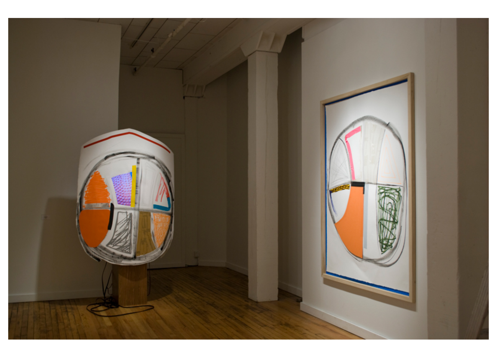
Sean Thomas Blott, Installation view: left, Untitled Basketbal Tower , 2011, Mixed media, right, Untitled Basketball Drawing , 2011, Mixed media on paper, 50 x 68".