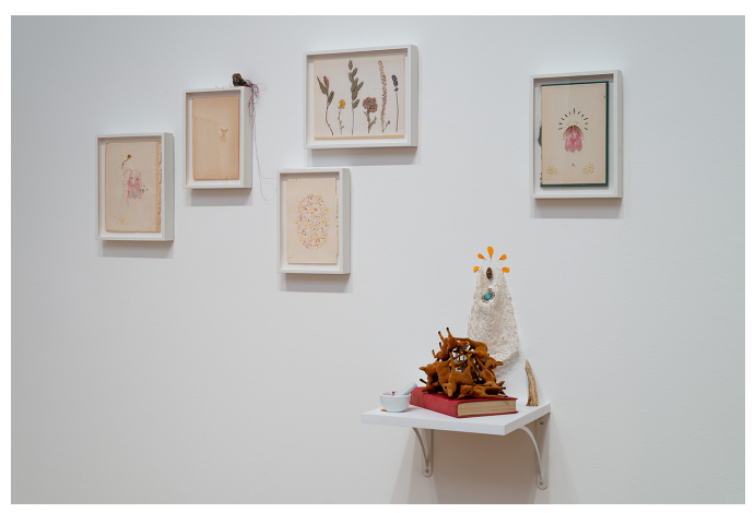
Installation view, 'Rodolfo Marron III: A Poke Ghost and the Garden of Tearz' at the Nerman Museum of Contemporary Art (click to enlarge)

The materials here include pressed flowers ("Flowers for the Ones I Love") as well as drawings of floral patterns made from bilberries, hibiscus, and butterfly ink, all done on paper taken from books found at the thrift store. Their small, similar size gives the drawings the appearance of intimate recollections from a diary. You can see that great care has been taken to ensure that lines and other markings are given the right amount of precision and fragility. Their gentleness is almost too precious.