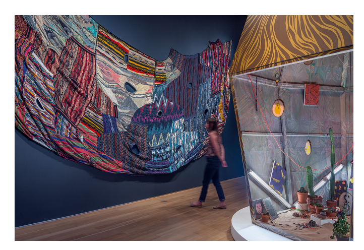
Installation view, 'Amir H. Fallah: The Caretaker' at the Nerman Museum of Contemporary Art (click to enlarge)

These canvases depict amorphous shapes which appear to the eye as patterned shrouds, raising the question of whether they're human or sculptural figures. Except for the different colors and patterns, the shapes are indistinguishable from one another, like a group of ghostly apparitions. They evoke the human need to veil or costume ourselves with objects and materials, wearing adornments so that we are perceived as we wish to be instead of presenting ourselves as we really are.