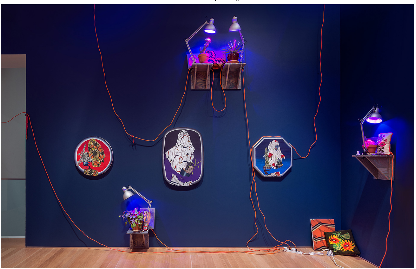
Installation view, 'Amir H. Fallah: The Caretaker' at the Nerman Museum of Contemporary Art

These canvases depict amorphous shapes which appear to the eye as patterned shrouds, raising the question of whether they're human or sculptural figures. Except for the different colors and patterns, the shapes are indistinguishable from one another, like a group of ghostly apparitions. They evoke the human need to veil or costume ourselves with objects and materials, wearing adornments so that we are perceived as we wish to be instead of presenting ourselves as we really are.