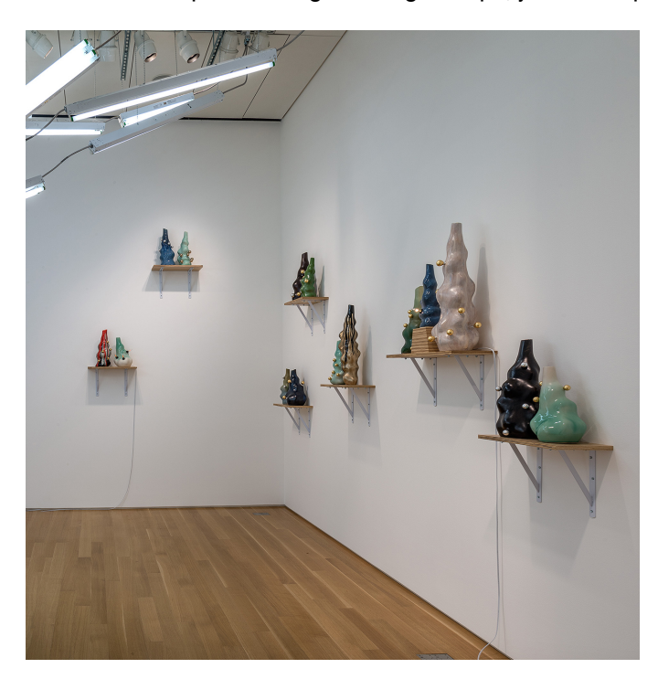
Installation view, 'Mark Cowardin: The Space Between' at the Nerman Museum of Contemporary Art (click to enlarge)

lights and extension cords promiscuously. I could feel a slow resentment creeping in over that wasteful atmosphere of high-wattage lamps, just to keep all those cacti thriving.